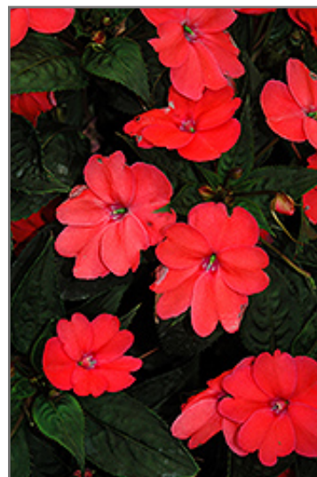
SunPatiens Compact Coral New Guinea Impatiens flowers

SunPatiens Compact Coral New Guinea Impatiens is recommended for the following landscape applications;