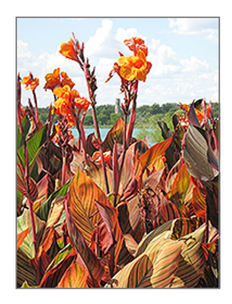
Tropicanna Canna in bloom