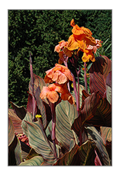
Tropicanna Canna flowers

This plant should only be grown in full sunlight. It prefers to grow in moist to wet soil, and will even tolerate some standing water. It is not particular as to soil type or pH. It is highly tolerant of urban pollution and will even thrive in inner city environments. Consider applying a thick mulch around the root zone in winter to protect it in exposed locations or colder microclimates. This particular variety is an interspecific hybrid. It can be propagated by division; however, as a cultivated variety, be aware that it may be subject to certain restrictions or prohibitions on propagation.