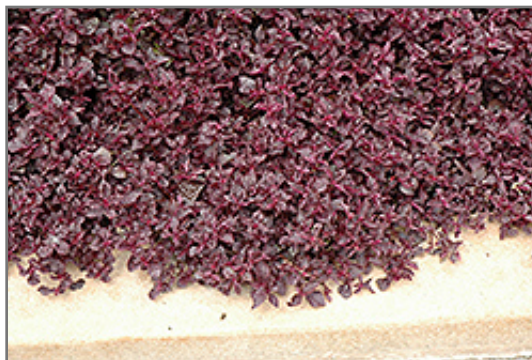
Purple Lady Blood Leaf