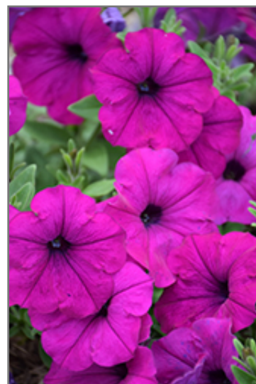
Easy Wave Violet Petunia flowers