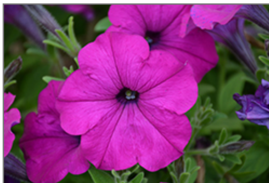
Easy Wave Violet Petunia flowers

This plant will require occasional maintenance and upkeep. Trim off the flower heads after they fade and die to encourage more blooms late into the season. It is a good choice for attracting bees and hummingbirds to your yard, but is not particularly attractive to deer who tend to leave it alone in favor of tastier treats. It has no significant negative characteristics.