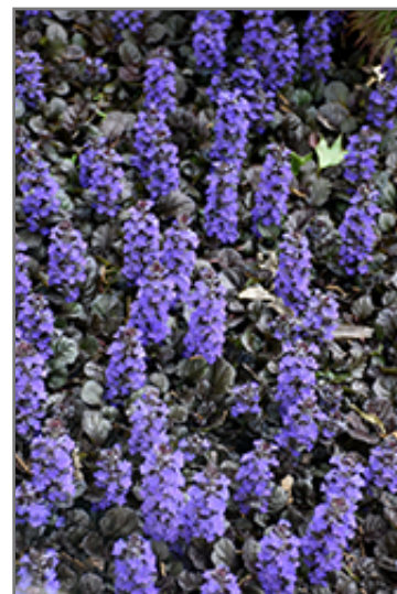
Black Scallop Bugleweed flowers

Black Scallop Bugleweed is recommended for the following landscape applications;