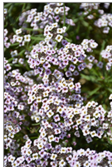
Blushing Princess Sweet Alyssum flowers

This plant will require occasional maintenance and upkeep, and should not require much pruning, except when necessary, such as to remove dieback. It is a good choice for attracting bees and butterflies to your yard, but is not particularly attractive to deer who tend to leave it alone in favor of tastier treats. It has no significant negative characteristics.