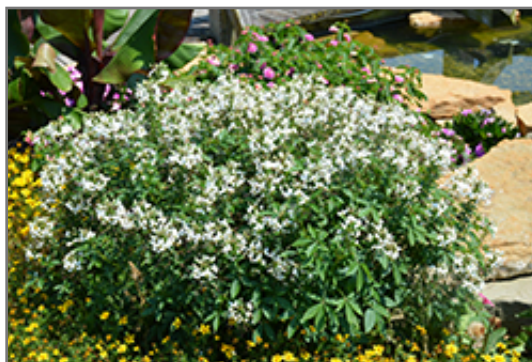
Senorita Blanca Spiderflower in bloom

Senorita Blanca Spiderflower is a fine choice for the garden, but it is also a good selection for planting in outdoor containers and hanging baskets. With its upright habit of growth, it is best suited for use as a 'thriller' in the 'spiller-thriller-filler' container combination; plant it near the center of the pot, surrounded by smaller plants and those that spill over the edges. It is even sizeable enough that it can be grown alone in a suitable container. Note that when growing plants in outdoor containers and baskets, they may require more frequent waterings than they would in the yard or garden.