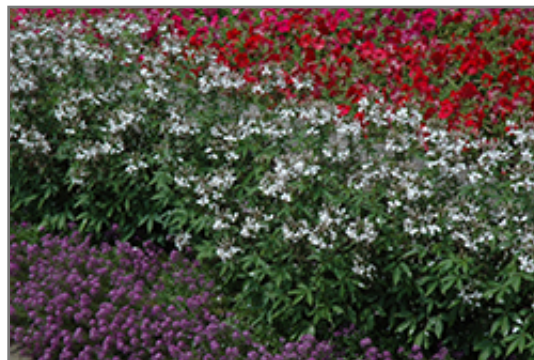
Senorita Blanca Spiderflower in bloom