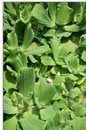
Water Lettuce foliage

This plant will require occasional maintenance and upkeep, and is best cleaned up in early spring before it resumes active growth for the season. Gardeners should be aware of the following characteristic(s) that may warrant special consideration;