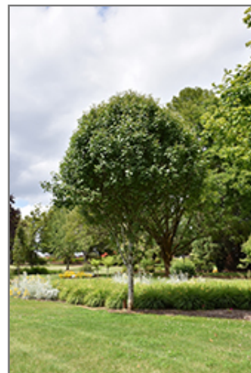
Jack Ornamental Pear

This tree should only be grown in full sunlight. It prefers to grow in average to moist conditions, and shouldn't be allowed to dry out. It is not particular as to soil type or pH. It is highly tolerant of urban pollution and will even thrive in inner city environments. This is a selected variety of a species not originally from North America.