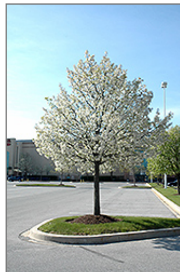
Jack Ornamental Pear in bloom