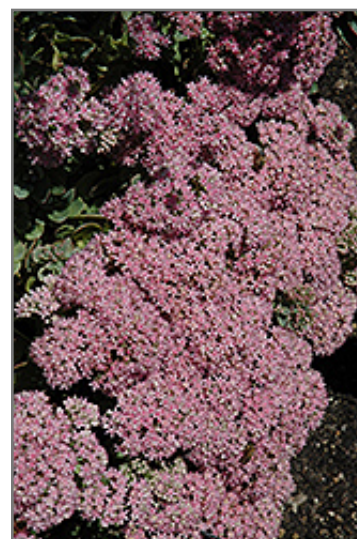
Lime Zinger Stonecrop flowers

This is a relatively low maintenance plant, and is best cleaned up in early spring before it resumes active growth for the season. It is a good choice for attracting bees and butterflies to your yard, but is not particularly attractive to deer who tend to leave it alone in favor of tastier treats. It has no significant negative characteristics.