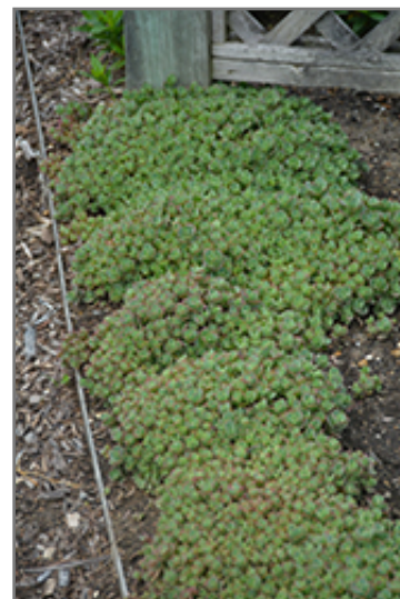
Lime Zinger Stonecrop

Lime Zinger Stonecrop will grow to be only 4 inches tall at maturity extending to 6 inches tall with the flowers, with a spread of 18 inches. When grown in masses or used as a bedding plant, individual plants should be spaced approximately 15 inches apart. Its foliage tends to remain low and dense right to the ground. It grows at a fast rate, and under ideal conditions can be expected to live for approximately 15 years. As an herbaceous perennial, this plant will usually die back to the crown each winter, and will regrow from the base each spring. Be careful not to disturb the crown in late winter when it may not be readily seen!