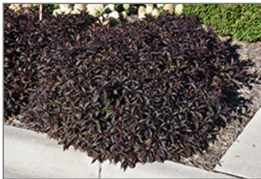
Spilled Wine Weigela