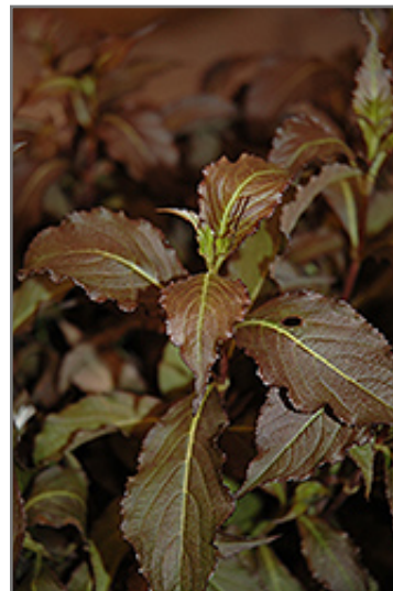
Spilled Wine Weigela foliage

Spilled Wine Weigela makes a fine choice for the outdoor landscape, but it is also well-suited for use in outdoor pots and containers. Because of its height, it is often used as a 'thriller' in the 'spiller-thriller-filler' container combination; plant it near the center of the pot, surrounded by smaller plants and those that spill over the edges. It is even sizeable enough that it can be grown alone in a suitable container. Note that when grown in a container, it may not perform exactly as indicated on the tag - this is to be expected. Also note that when growing plants in outdoor containers and baskets, they may require more frequent waterings than they would in the yard or garden.