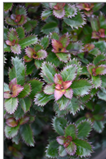
Sallywag Holly foliage