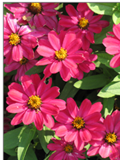
Profusion Cherry Zinnia flowers