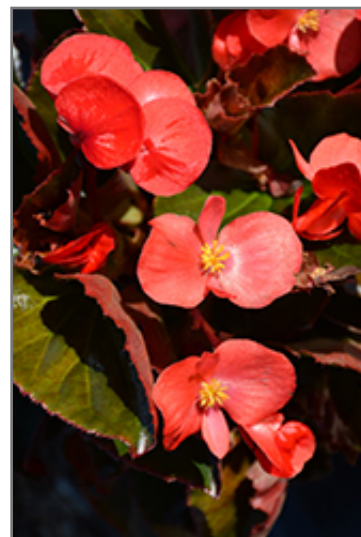
Big Red Bronze Leaf Begonia flowers

Big Red Bronze Leaf Begonia is recommended for the following landscape applications;