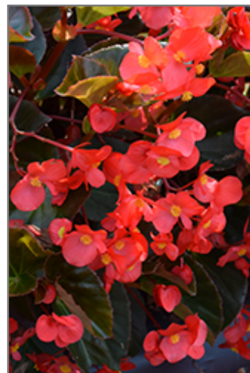
Big Red Bronze Leaf Begonia flowers

Big Red Bronze Leaf Begonia is a fine choice for the garden, but it is also a good selection for planting in outdoor containers and hanging baskets. It is often used as a 'filler' in the 'spiller-thriller-filler' container combination, providing a mass of flowers and foliage against which the larger thriller plants stand out. Note that when growing plants in outdoor containers and baskets, they may require more frequent waterings than they would in the yard or garden.