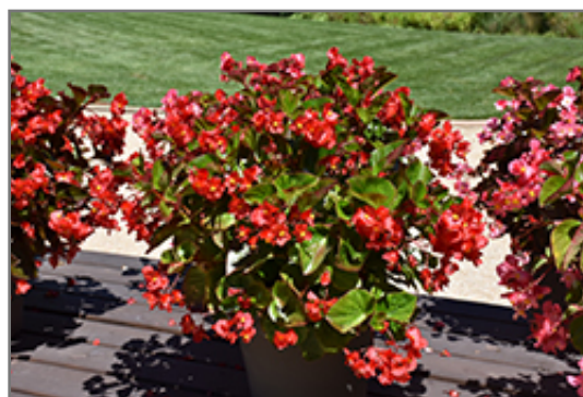
Whopper Red Green Leaf Begonia flowers