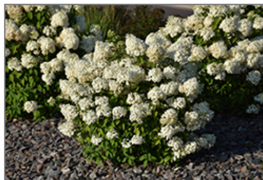
Bobo Hydrangea in bloom