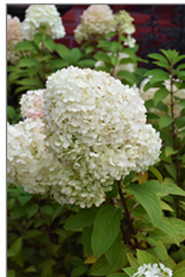
Bobo Hydrangea flowers