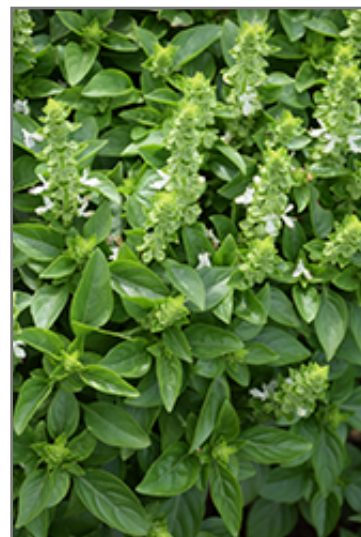
Spicy Globe Basil foliage

Spicy Globe Basil will grow to be about 12 inches tall at maturity, with a spread of 12 inches. When grown in masses or used as a bedding plant, individual plants should be spaced approximately 10 inches apart. This fast-growing annual will normally live for one full growing season, needing replacement the following year.