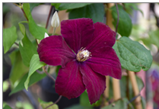
Rouge Cardinal Clematis flowers