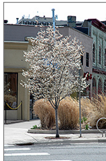
Autumn Brilliance Serviceberry in bloom