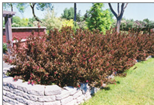
Wine and Roses Weigela