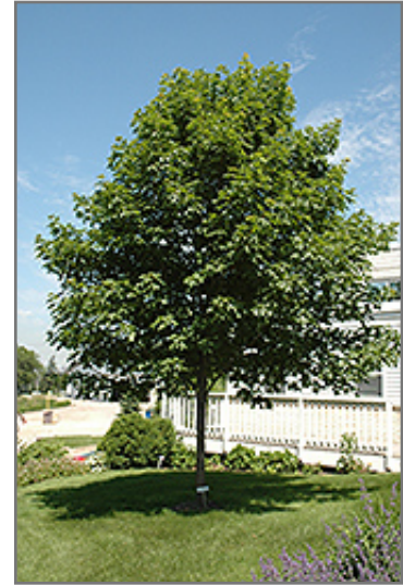
Fall Fiesta Sugar Maple

This tree should only be grown in full sunlight. It prefers to grow in average to moist conditions, and shouldn't be allowed to dry out. It is not particular as to soil pH, but grows best in rich soils. It is somewhat tolerant of urban pollution. This is a selection of a native North American species.