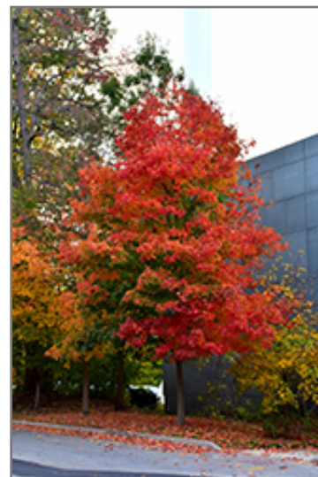
Fall Fiesta Sugar Maple in fall