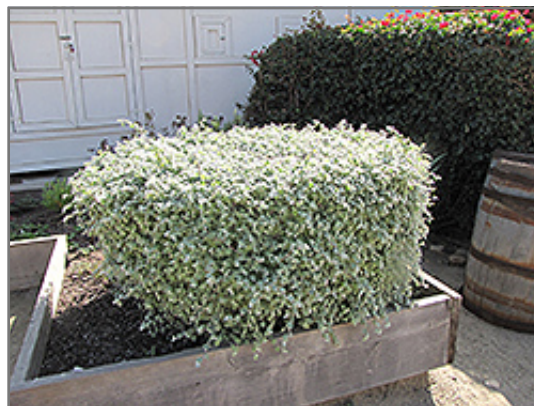
Licorice Plant