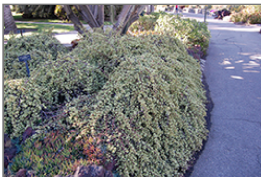
Variegated Elephant Food