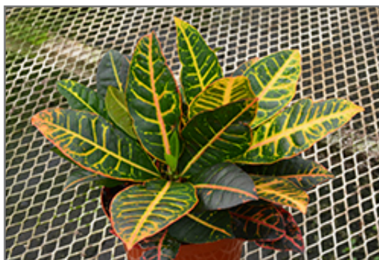
Petra Variegated Croton in full