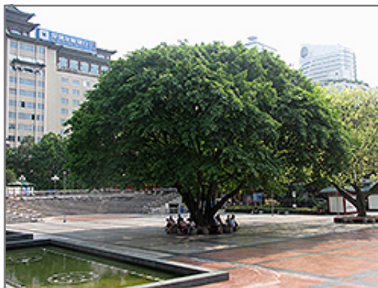
Indian Laurel Fig

This is a multi-stemmed evergreen houseplant with a more or less rounded form. This plant may benefit from an occasional pruning to look its best.