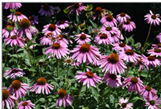
Magnus Coneflower flowers

Magnus Coneflower will grow to be about 24 inches tall at maturity extending to 3 feet tall with the flowers, with a spread of 24 inches. It grows at a medium rate, and under ideal conditions can be expected to live for approximately 10 years. As an herbaceous perennial, this plant will usually die back to the crown each winter, and will regrow from the base each spring. Be careful not to disturb the crown in late winter when it may not be readily seen!