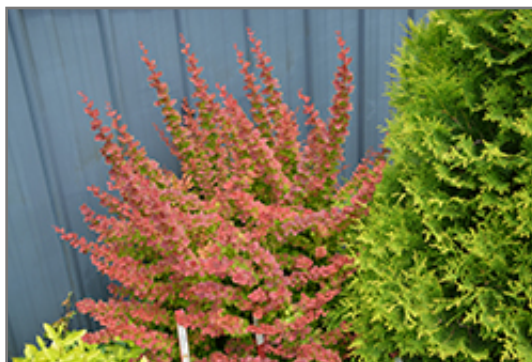
Sunjoy Tangelo Japanese Barberry

Sunjoy Tangelo Japanese Barberry will grow to be about 4 feet tall at maturity, with a spread of 4 feet. It tends to fill out right to the ground and therefore doesn't necessarily require facer plants in front. It grows at a medium rate, and under ideal conditions can be expected to live for approximately 20 years.