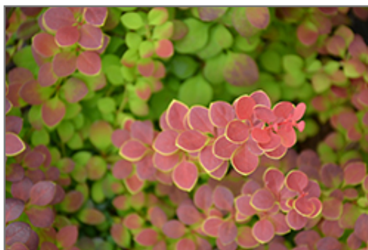
Sunjoy Tangelo Japanese Barberry foliage