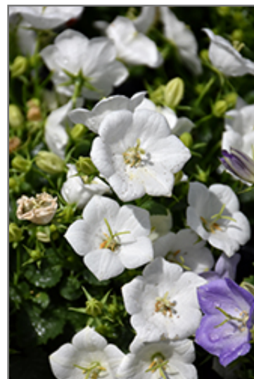
Rapido White Bellflower flowers