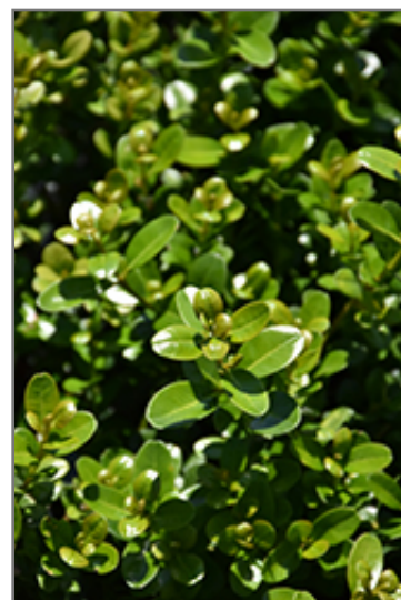
Sprinter Boxwood foliage