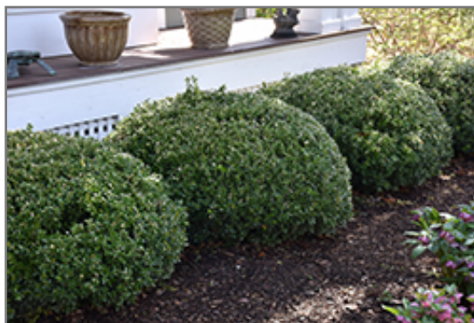
Sprinter Boxwood

Sprinter Boxwood will grow to be about 4 feet tall at maturity, with a spread of 4 feet. It tends to fill out right to the ground and therefore doesn't necessarily require facer plants in front. It grows at a fast rate, and under ideal conditions can be expected to live for approximately 30 years.