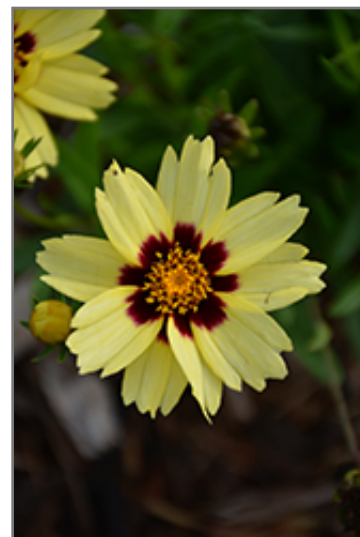
UpTick Cream and Red Tickseed flowers

UpTick Cream and Red Tickseed is recommended for the following landscape applications;