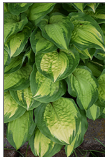
Island Breeze Hosta foliage