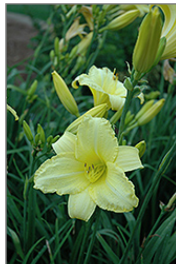
Happy Ever Appster Happy Returns Daylily flowers

Happy Ever Appster Happy Returns Daylily is recommended for the following landscape applications;