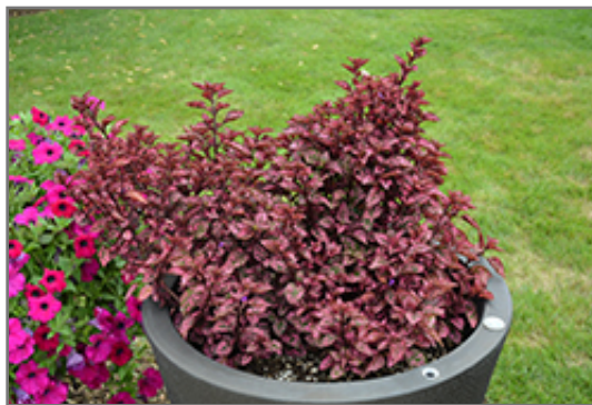
Hippo Rose Polka Dot Plant