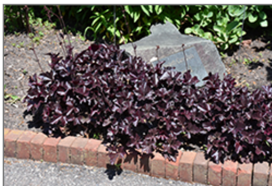
Obsidian Coral Bells