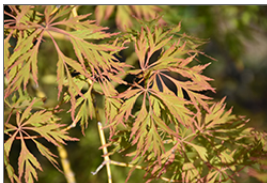
Ice Dragon Maple foliage