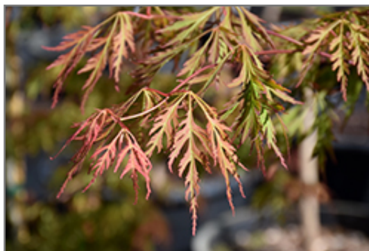
Ice Dragon Maple foliage

This is a relatively low maintenance dwarf tree, and should only be pruned in summer after the leaves have fully developed, as it may 'bleed' sap if pruned in late winter or early spring. It has no significant negative characteristics.