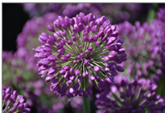
Lavender Bubbles Ornamental Onion flowers