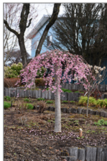
Pink Cascade Weeping Cherry in bloom