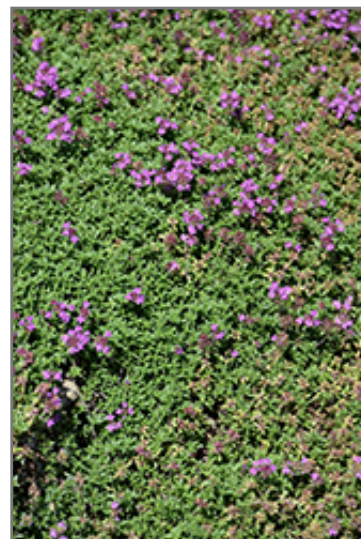
Creeping Thyme in bloom

Creeping Thyme is recommended for the following landscape applications;