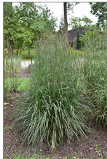
Blackhawks Bluestem in bloom