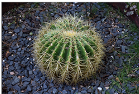
Golden Barrel Cactus

Golden Barrel Cactus is a succulent evergreen plant. It is a member of the cactus family, which are grown primarily for their characteristic shapes, their interesting features and textures, and their high tolerance for hot, dry growing environments. Like all cacti, it doesn't actually have leaves, but rather modified succulent stems that comprise the bulk of the plant, and which are designed to hold water for long periods of time. This particular cactus is valued for its distinctive barrel shape, and usually grows as a single spiny ribbed green stem. This plant has yellow cup-shaped flowers held atop the stems from late spring to early summer, which are interesting on close inspection.