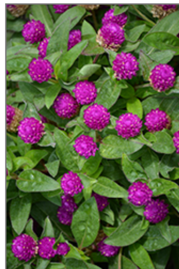
Ping Pong Purple Globe Amaranth flowers