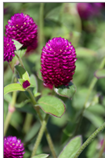
Ping Pong Purple Globe Amaranth flowers

Ping Pong Purple Globe Amaranth is recommended for the following landscape applications;