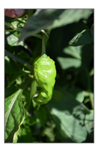
Ghost Hot Pepper fruit

Extremely hot and not for the faint of heart, this variety produces small fruits which emerge green and mature to a wrinkled red when ripe; good performer in containers or gardens; mature fruit is great for pickling, hot sauces and drying for seasonings