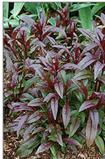
Husker Red Beard Tongue foliage