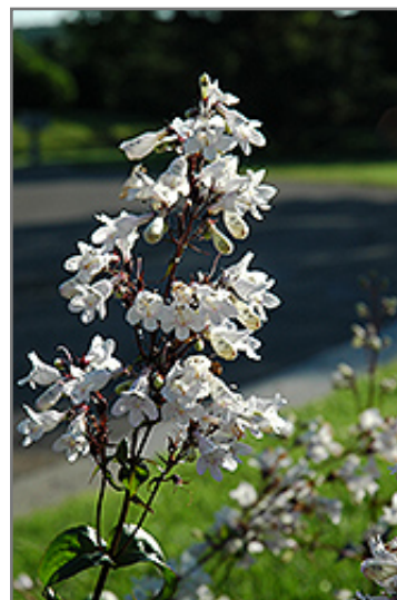
Husker Red Beard Tongue flowers