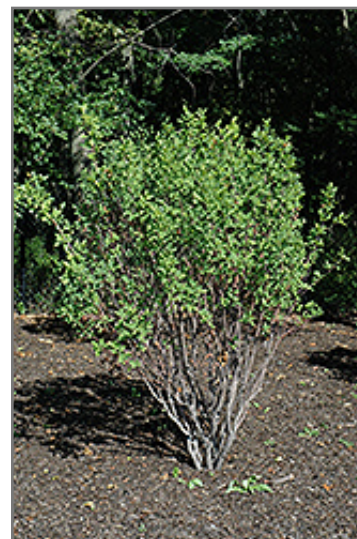
Rainbow Pillar Serviceberry

This is a relatively low maintenance shrub, and should not require much pruning, except when necessary, such as to remove dieback. It is a good choice for attracting birds to your yard, but is not particularly attractive to deer who tend to leave it alone in favor of tastier treats. It has no significant negative characteristics.