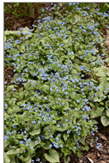
Jack Frost Bugloss in bloom

Jack Frost Bugloss is a fine choice for the garden, but it is also a good selection for planting in outdoor pots and containers. It is often used as a 'filler' in the 'spiller-thriller-filler' container combination, providing a mass of flowers and foliage against which the thriller plants stand out. Note that when growing plants in outdoor containers and baskets, they may require more frequent waterings than they would in the yard or garden.