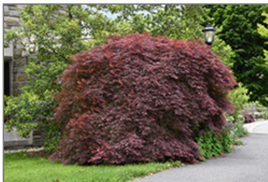
Tamukeyama Japanese Maple

Tamukeyama Japanese Maple is recommended for the following landscape applications;