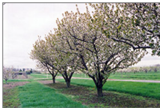
Sweet Cherry in bloom