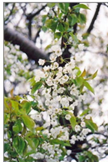
Sweet Cherry flowers

Sweet Cherry is covered in stunning clusters of fragrant white flowers hanging below the branches in early spring before the leaves. It has dark green deciduous foliage. The pointy leaves turn yellow in fall. The fruits are showy red drupes carried in abundance in mid summer. The fruit can be messy if allowed to drop on the lawn or walkways, and may require occasional clean-up. The smooth dark red bark adds an interesting dimension to the landscape.