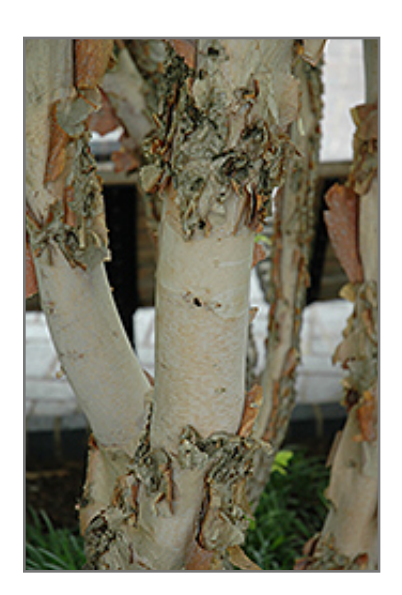
Fox Valley River Birch bark

Fox Valley River Birch is recommended for the following landscape applications;