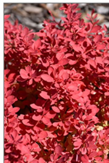
Sunjoy Neo Japanese Barberry foliage