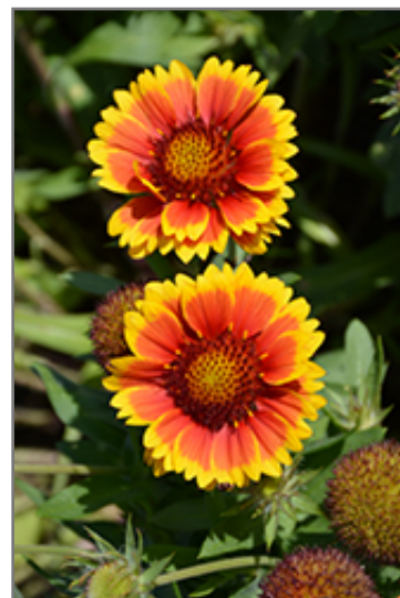
Arizona Sun Blanket Flower flowers

Arizona Sun Blanket Flower is recommended for the following landscape applications;